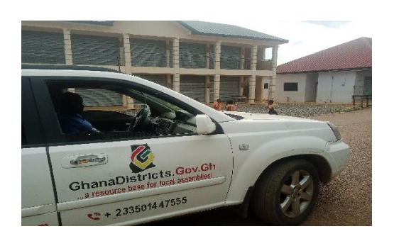
Ten lockable stores